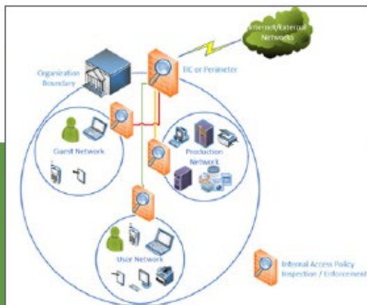
Figure 3. Segmented Network